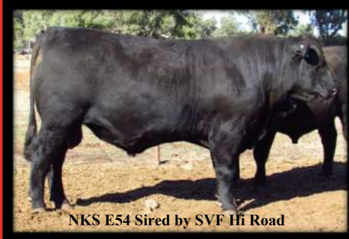
NKS E54 Sired by SVF Hi Road