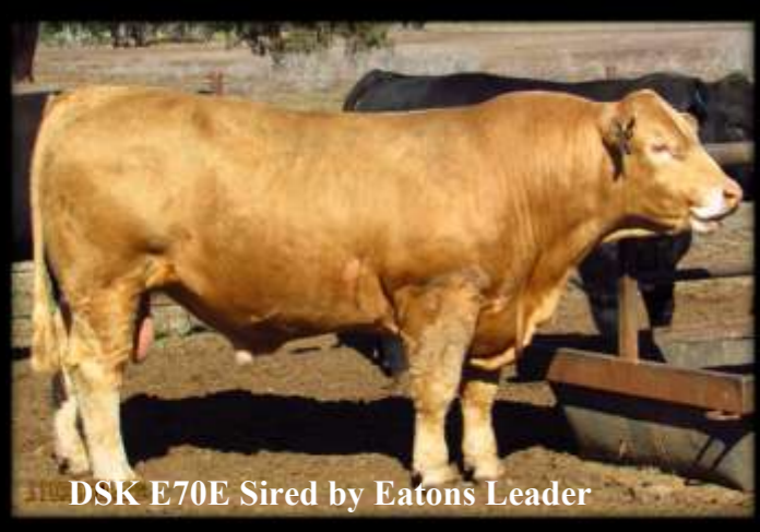
DSK E70E Sired by Eatons Leader

View online catalogue soon at www.dskangusandcharolais.com.au