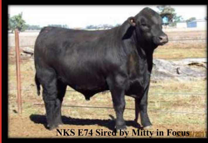
NKS E74 Sired by Mitty in Focus